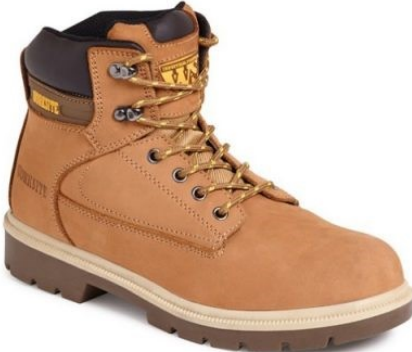
Safety Boot: WSITE TAN £28.00