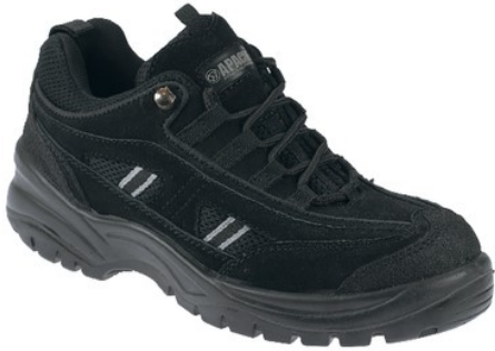
Safety Trainer: AP302 £25.00