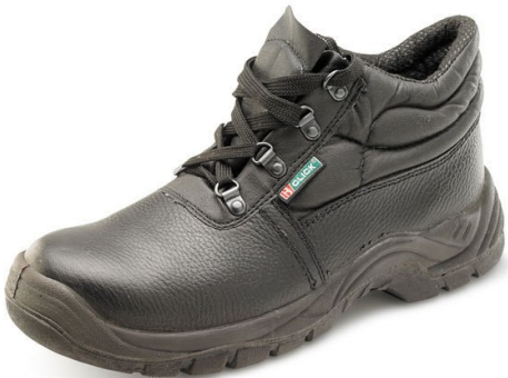
Safety Boot: CHUKKA £18.00